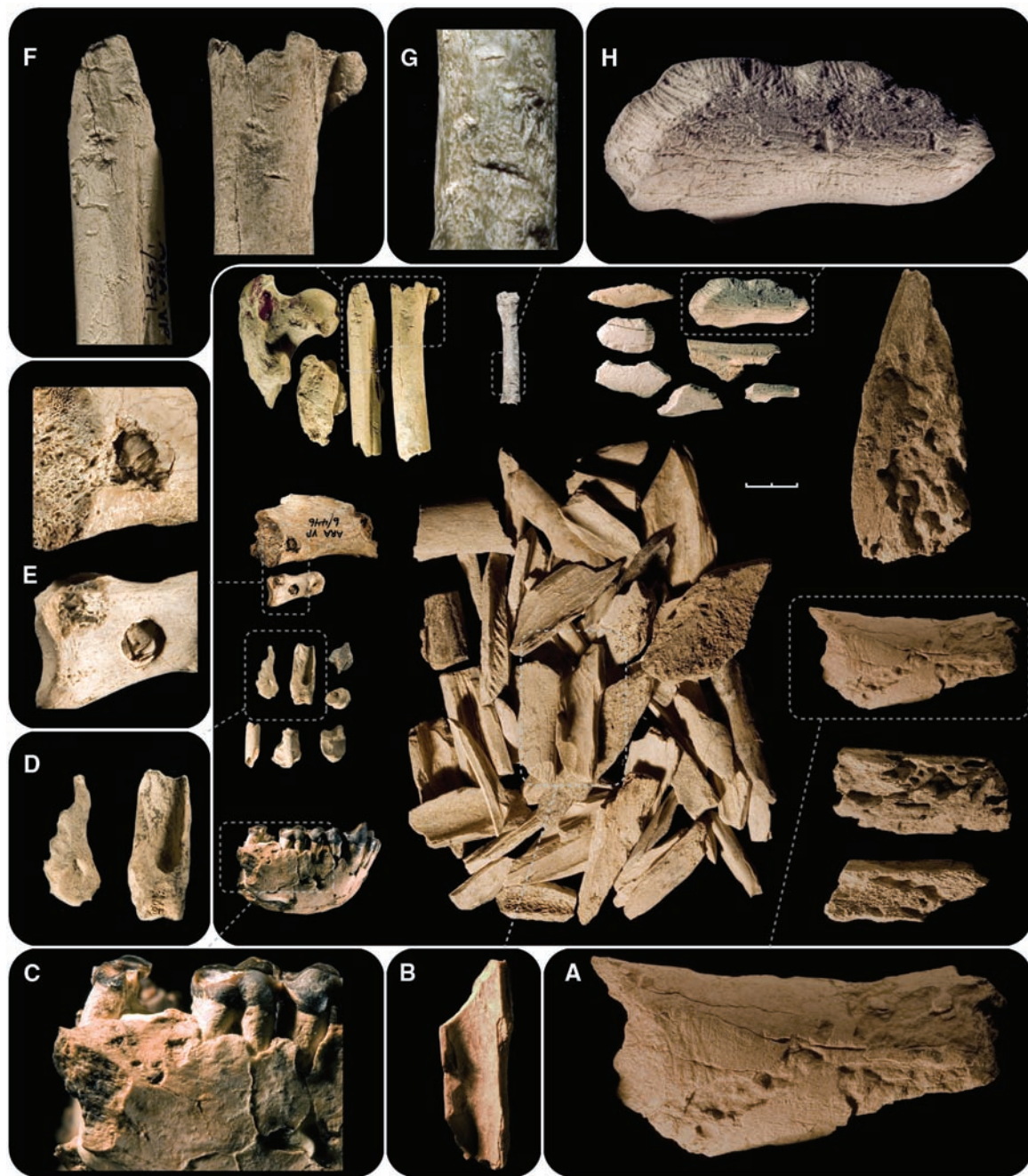
Fig. 1. Bone modification of medium and large mammalian remains from the Lower Aramis Member. The central panel shows limb bone shaft splinters that are ubiquitous in the assemblage and were collected by the thousands during the 100% recovery operation. Scale bar, 2 cm. (A) Termite damage. (B) Inner conchoidal scars from carnivore gnawing. (C) Carnivore tooth marks on an Ardipithecus mandible corpus. (D) Stomach acid etching on an artiodactyl phalanx and bone splinter of a medium-sized mammal. (E) Carnivore tooth punctures. (F) Gnawing damage by a small-to-medium carnivore on cercopithecoid limb bones. (G) Similar damage on an Ardipithecus metacarpal. (H) Damage from gnawing by a small rodent on a large-mammal limb bone shaft fragment.

SAG-VP-3 localities, 0.5 and 2.0 km southeast of the easternmost Ar. ramidus occurrence. Here, different assemblage composition (table S1) and modification signatures are present. Micromammals, birds, and primates are absent from the Lower Aramis inter-tuff horizon within these spatially extensive but faunally depauperate localities ( n = 5 and 3 identified specimens, respectively). Sublocalities with the most surface bone were circumscribed within each of these localities, and fossils were collected by identical methods for comparison with the faunally richer Ardipithecus -bearing localities to the northwest. The resulting assemblages are dominated by poorly preserved (highly weathered) remains of large, mostly aquatic animals, which is consistent with their more axial location in the