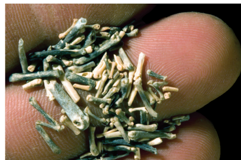
Abundance of birds (left) associated with Ar. ramidus . These distributions are consistent with a mostly woodland habitat. (Above) An example of the many small mammal and bird bones.

damage patterns of the fossils representing small mammals and birds suggest that they are derived from undigested material regurgitated by owls (owl pellets). Because of their fragility and size, bird bones have been rare or absent at most other eastern African fossil assemblages that included early hominids. However, we cataloged 370 avian fossils; these represent 29 species, several new to science. Most of the birds are terrestrial rather than aquatic, and small species such as doves, lovebirds, mousebirds, passerines, and swifts are abundant. Open-country species are rare. Eagles and hawks/kites are present, but the assemblage is dominated by parrots and the peafowl Pavo , an ecological indicator of wooded conditions.